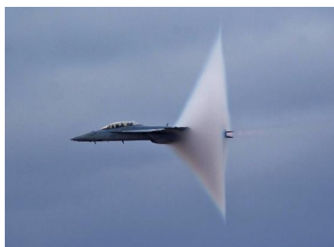
Figure 2: Condensation in transonic/supersonic flow (vapor cone)

The focus of this PhD is the investigation of condensation phenomena in high-speed compressible flows [3,4]. Such phenomena are directly observable in the condensation trails formed around aircraft during transonic flight conditions (Figure 2), illustrating the strong coupling between rapid expansion, pressure drop, and phase change.